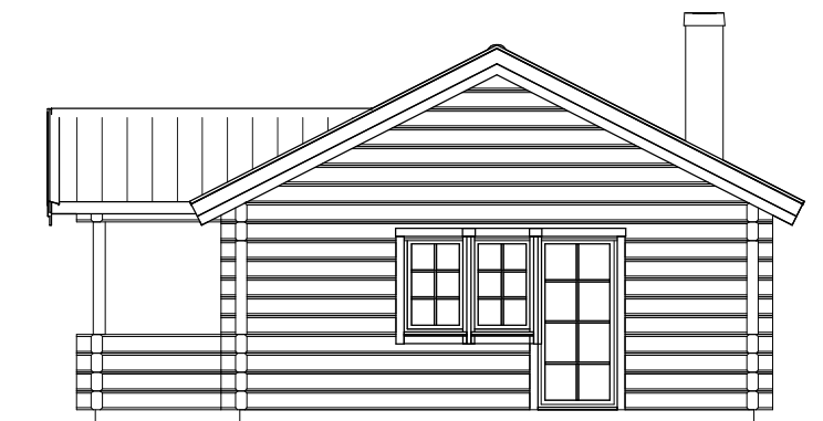
FASAD MOT HÖGER