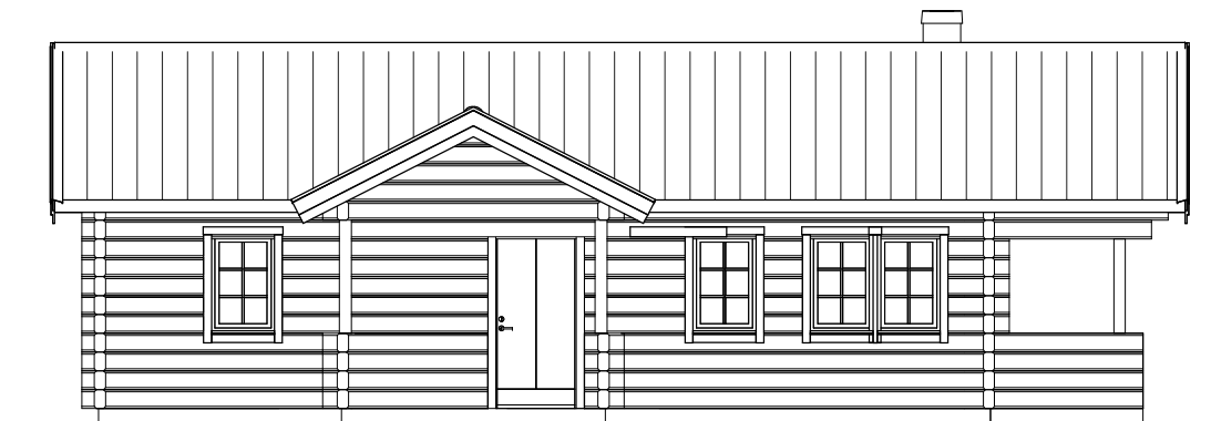
FASAD MOT FRAMSIDA