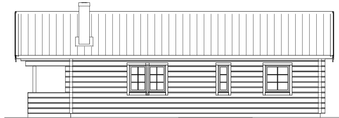
FASAD MOT BAKSIDA